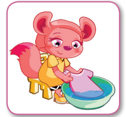
do the laundry