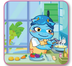
cook American food