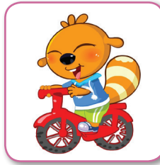
ride a bike