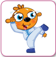
practice kung fu