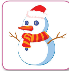
make a snowman